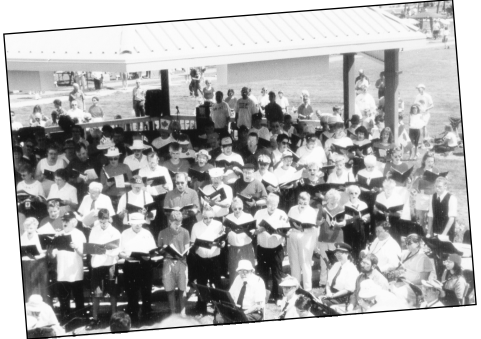
The opening of the Riverwalk Amphitheatre